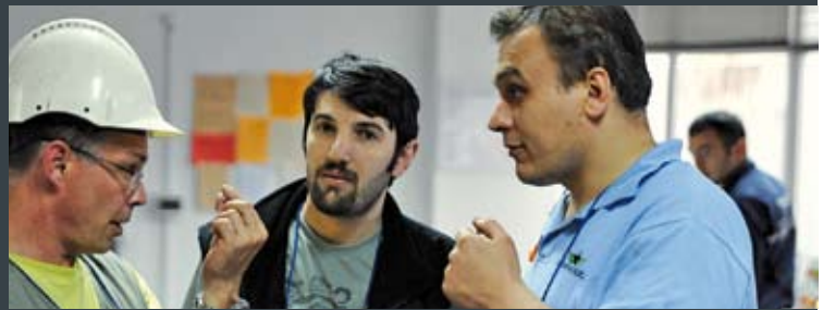
In unbelieving amazement... 24% of glue savings

The Ecoresinator is well suited for subsequent retrofitting of an existing plant and can be installed within a short time.