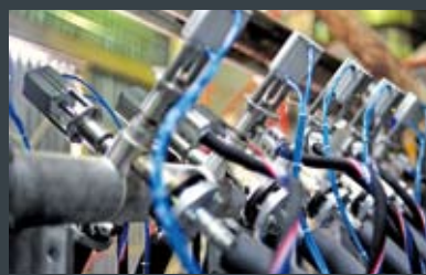
Ecoresinator at Starwood, Turkey